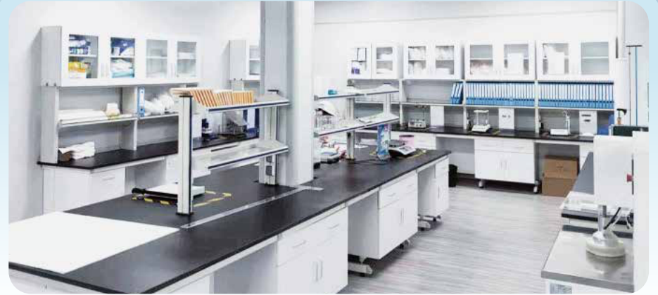
Advanced R&D and quality control lab ensuring product standards from materials to finished goods.