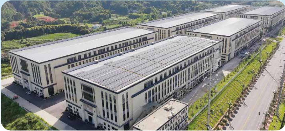
A modern, solar-powered integrated industrial complex, showcasing the scale of one of our main manufacturing bases.