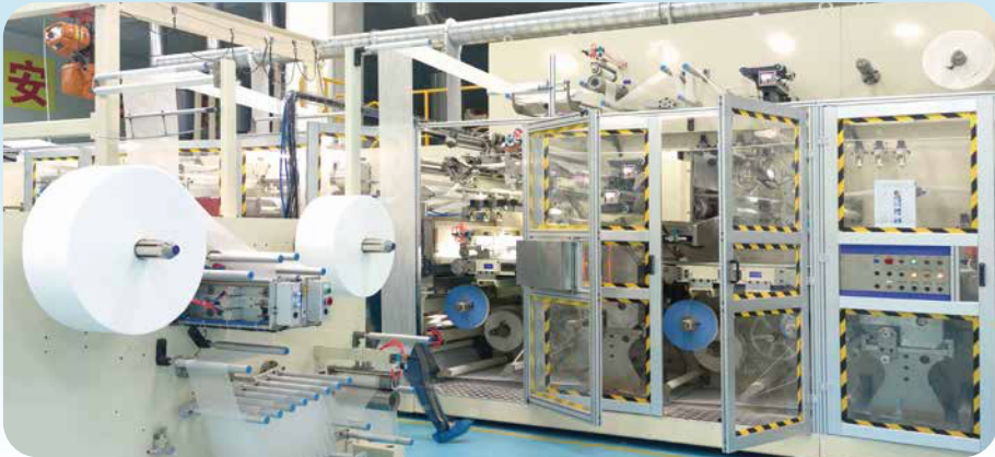
Automated, high-speed manufacturing lines producing non-woven hygienic products.