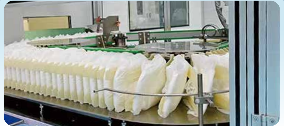
Precision handling and quality checks on finished products just before final packaging.